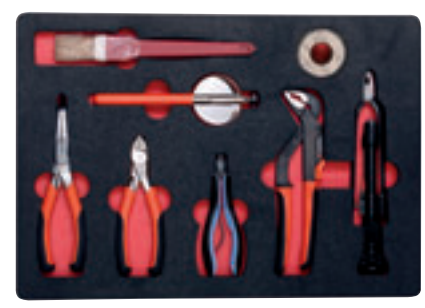
Aviation Tool Box: Tray 3

Article Codes stand for empty foams and cases